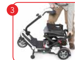
Fold and Lock Tiller