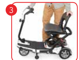
Unfold Seat; Lock in Place